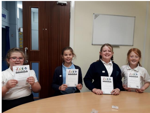
1 - JRSOs from Dunston St Peters looking keen to plan and organise some road safety education in school.

Lincolnshire's Junior Road Safety Officers have been busy across the county this academic year! We currently have over 205 JRSOs across 59 primary schools around Lincolnshire and your school can join the scheme at any time. Please contact your local Road Safety Officer for more information.