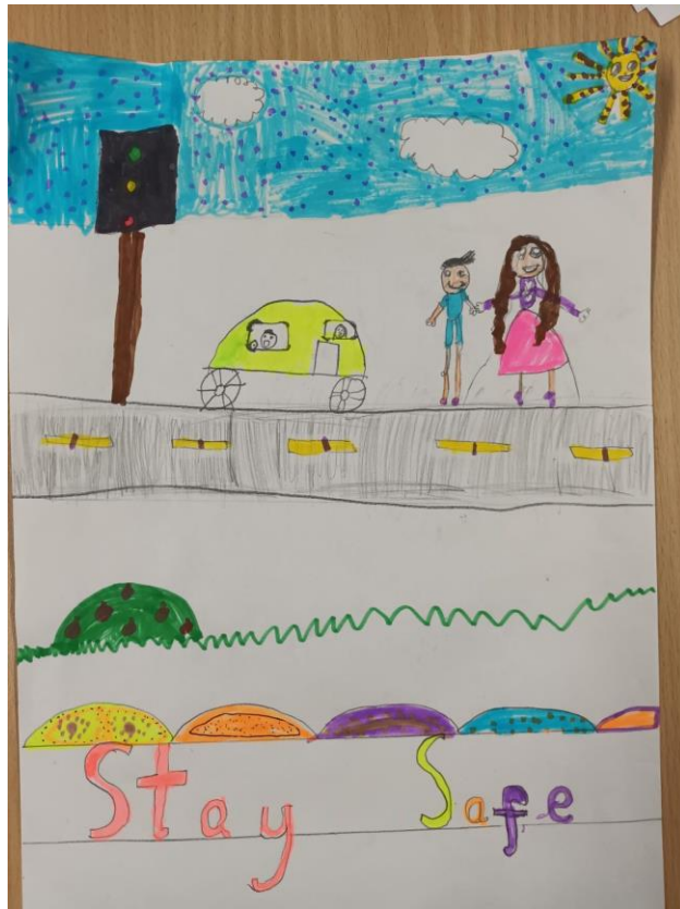
4 - South Hykeham Primary's JRSOs design your own poster competition! A Key Stage 1 Entry.

JRSOs will turn their attention to In Car Safety this Spring term, where the focus will be on ways for pupils to stay safe on car journeys, whether long or short.