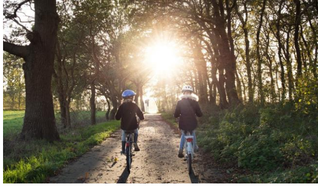
14 - Always wear a cycle helmet for all journeys, no matter how short.