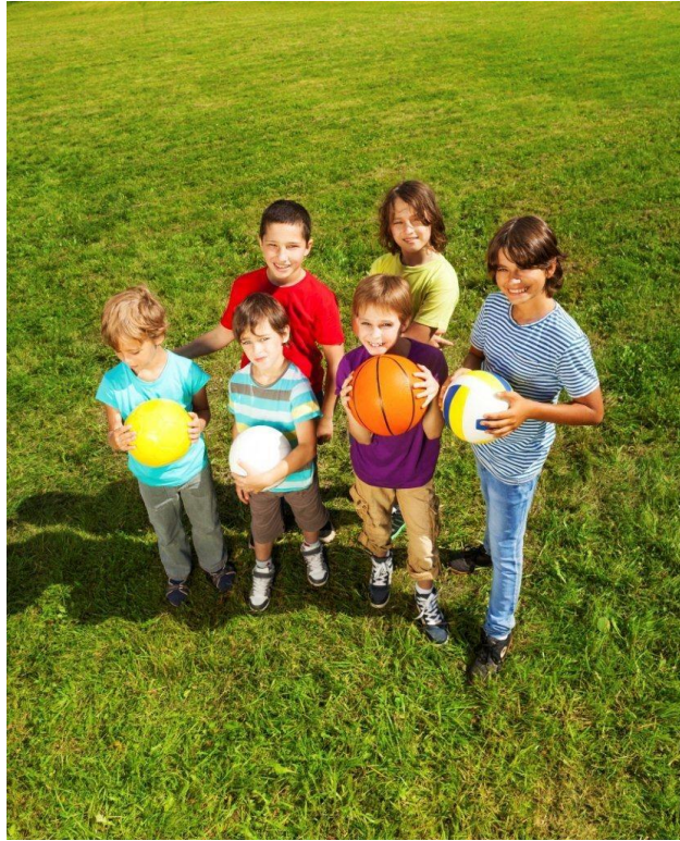
16 - Encourage children to meet up and play in safe places, away from moving traffic. Gardens, parks and green spaces are much safer than roads, car parks or driveways.