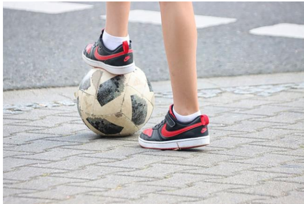
17 - Always watch out for children playing when driving around in residential areas, especially as the weather warms up. Young children don't always have road awareness and can easily wander or fall into the road.