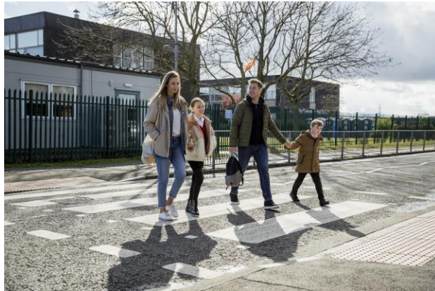
15 - Adults can set a good example for children by holding hands, choosing safe places to cross roads and demonstrating the use of Stop, Look, Listen and Think.