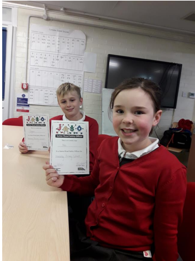
3 - Navenby JRSOs ready to get to work!